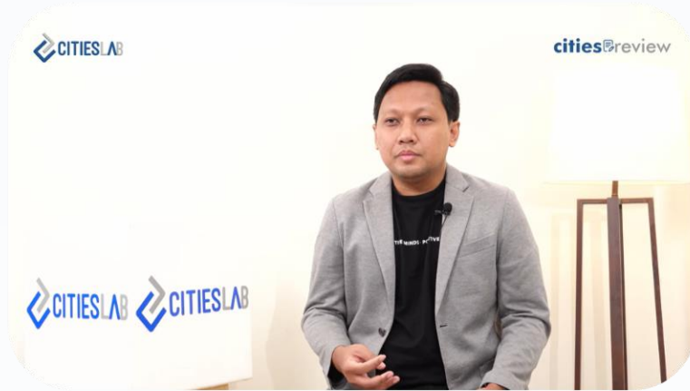
Citiesreview - Mengelola Urbanisasi Melalui Nature-Based Solution