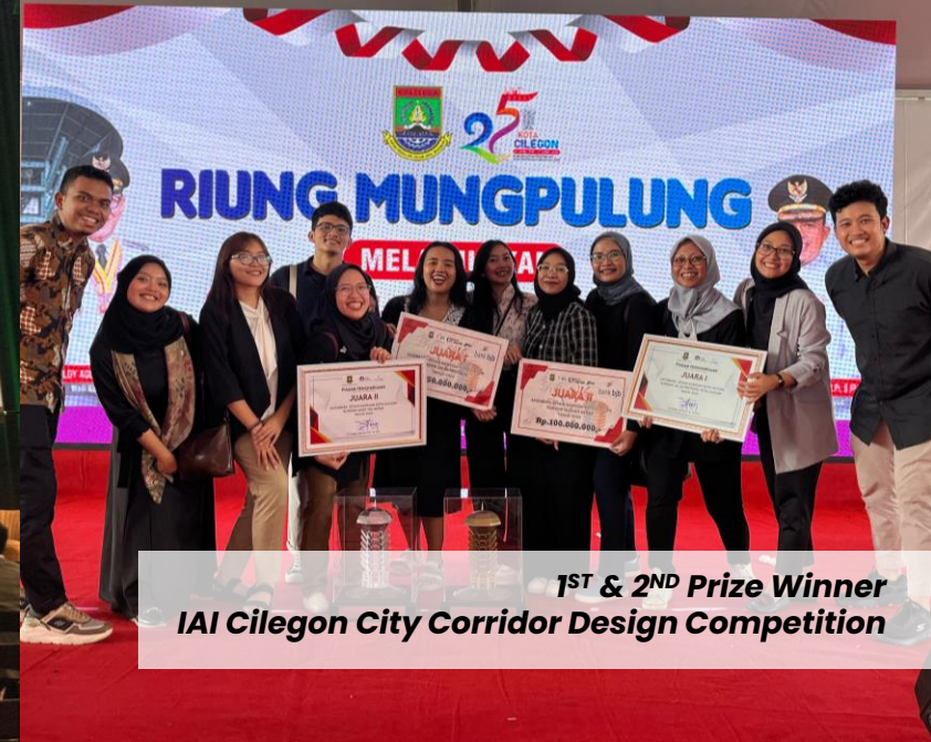
1st & 2nd Prize Winner IAI Cilegon City Corridor Design Competition