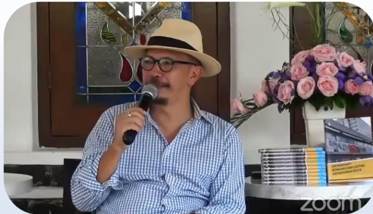
Citiestalk: Diskusi Urbanisasi & Vibrancy Kota Indonesia