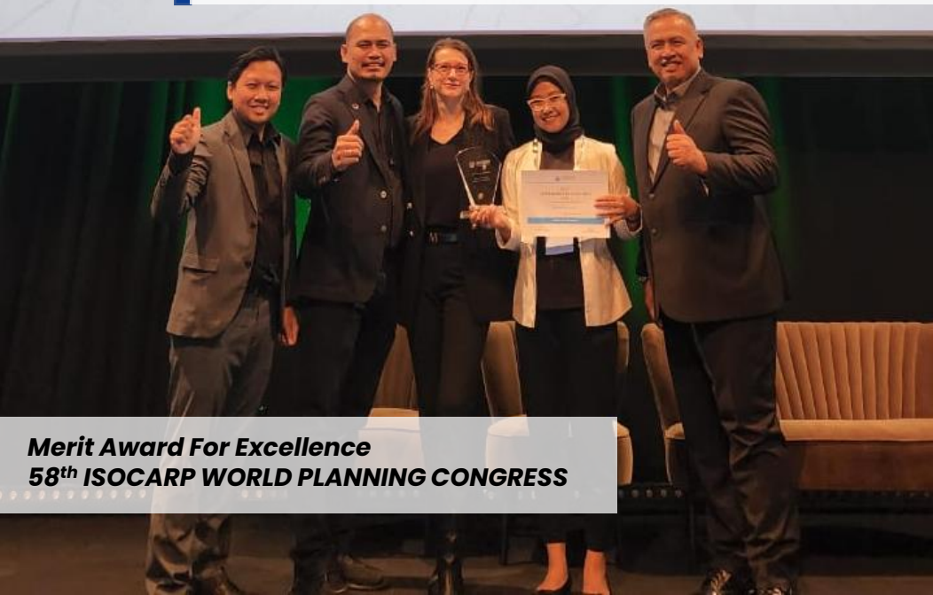
Merit Award For Excellence 58th ISOCARP WORLD PLANNING CONGRESS

Excellence in Planning for Community Engagement & Social Inclusiveness "Silver" 9th SIP Planning Awards 2025